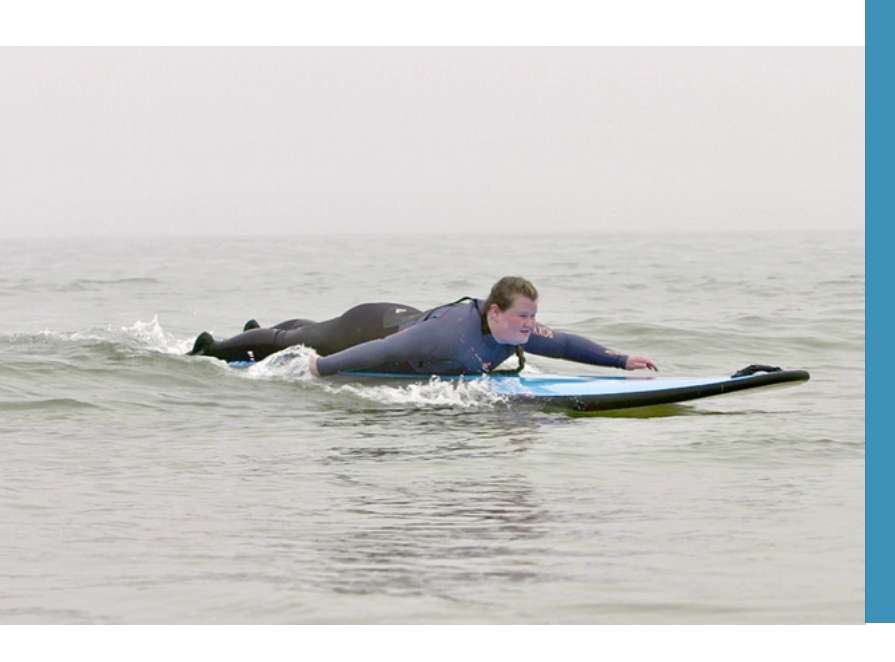
Scotland is heading to the ISA World Para Surf Championship - for the first